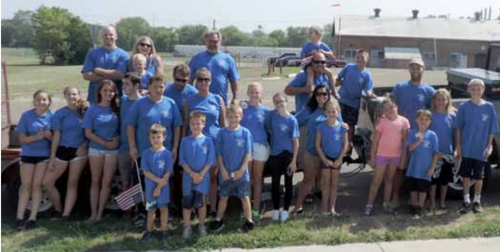
Thanks to all the members and their families that joined us for the Labor Day Parade in Barberton this year.