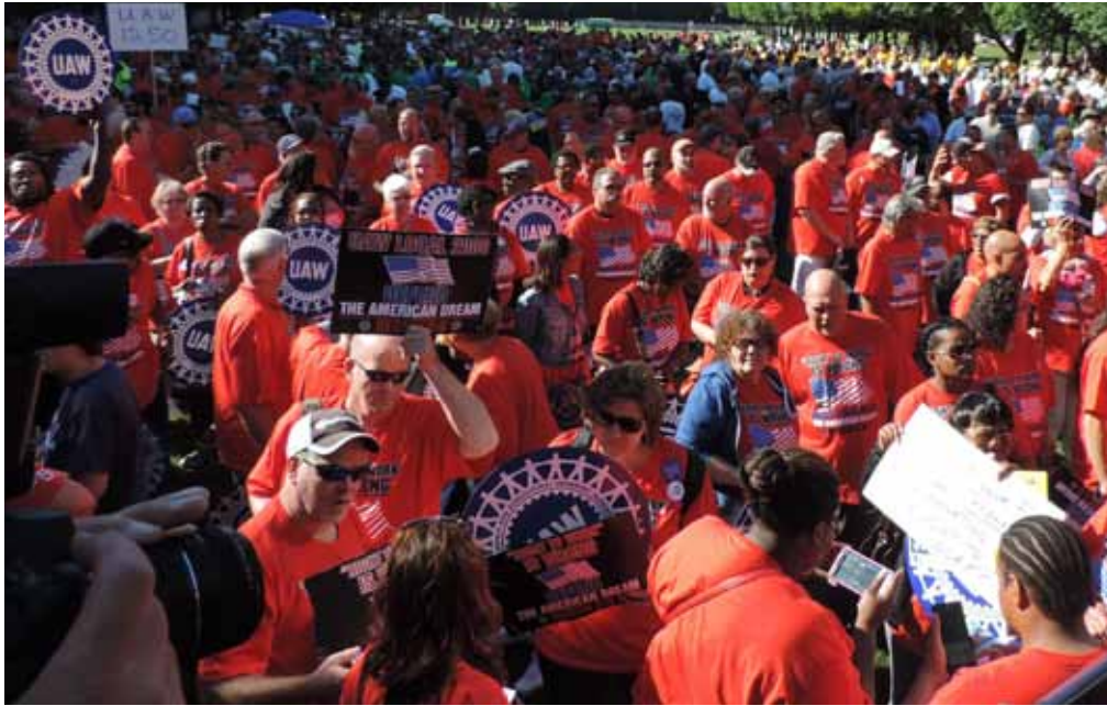
In total, there were several thousand union Brothers and Sisters who attended the rally in Columbus.